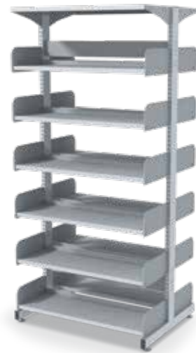
Freestanding double sided.