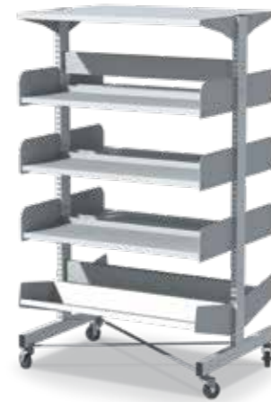
Double sided mobile.

Note: Shelf capacities may vary, contact your Dexion Supply Centre representative for specific maximum loads based on your configuration.